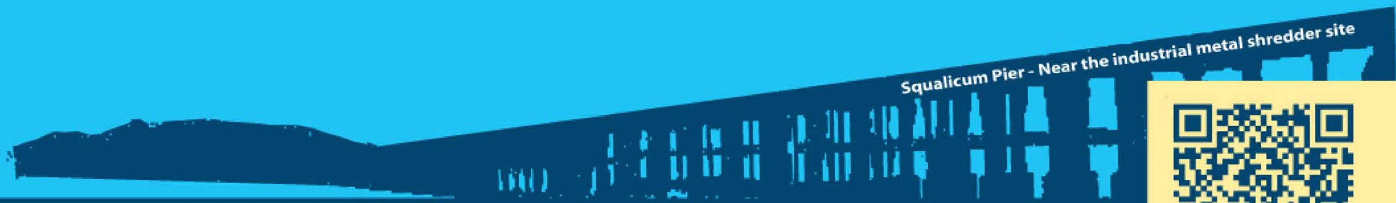
Squalicum Pier - Near the industrial metal shredder site